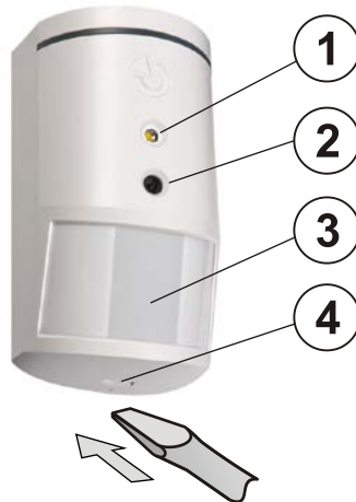
Figure: 1 – flash for illumination; 2 – camera lens; 3 – PIR detector lens; 4 – cover tab;

The detector can be installed onto a wall or in the corner of a room. There should be no obstacles which quickly change temperature (e.g. heating appliances,) or which move (e.g. curtains hanging above a radiator, robotic vacuum cleaners, pets) in the detector's field of sight. It is not recommended to install the detector opposite to windows or in places with over-intense air circulation (close to ventilators, heat sources, air conditioning outlets, unsealed doors, etc.). There should be no obstacles in front of the detector which might obstruct its view of the protected area.