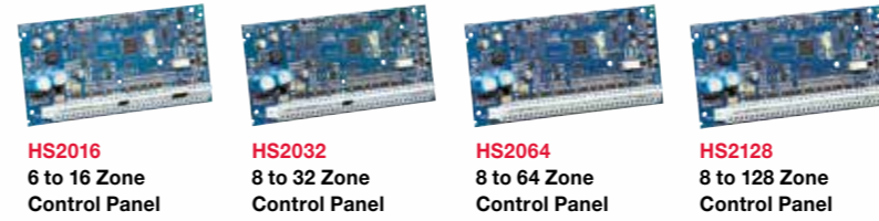
HS2016 6 to 16 Zone Control Panel HS2032 8 to 32 Zone Control Panel HS2064 8 to 64 Zone Control Panel HS2128 8 to 128 Zone Control Panel