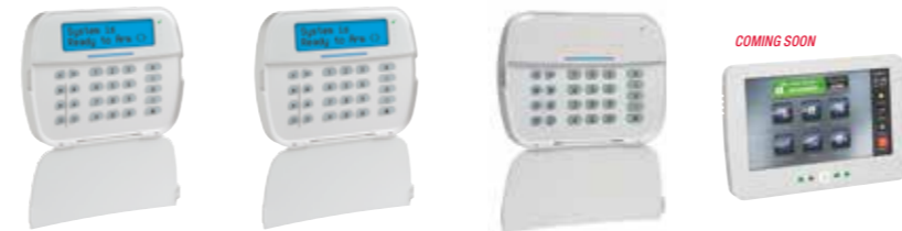
HS2LCD Full Message LCD Keypad HS2LCDP Full Message LCD Keypad with Prox Support HS2LED 16-Zone LED Hardwired Keypad HS2TCHP 7 inch Hardwired TouchScreen Keypad with Prox Support