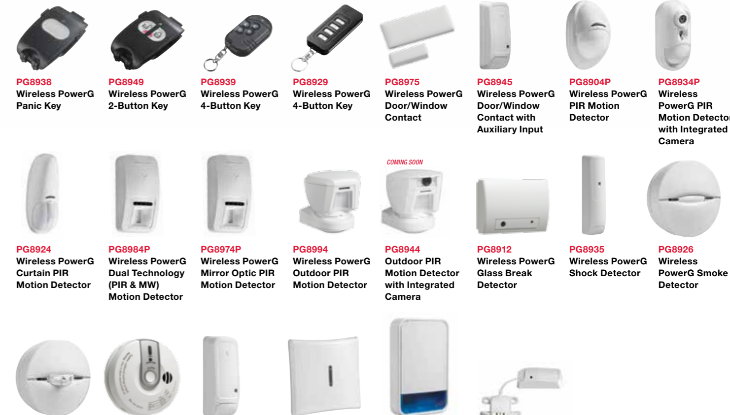
PG8938 Wireless PowerG Panic Key PG8949 Wireless PowerG 2-Button Key PG8939 Wireless PowerG 4-Button Key PG8929 Wireless PowerG 4-Button Key PG8975 Wireless PowerG Door/Window Contact PG8945 Wireless PowerG Door/Window Contact with Auxiliary Input PG8904P Wireless PowerG PIR Motion Detector PG8934P Wireless PowerG PIR Motion Detector with Integrated Camera PG8924 Wireless PowerG Curtain PIR Motion Detector PG8984P Wireless PowerG Dual Technology (PIR & MW) Motion Detector PG8974P Wireless PowerG Mirror Optic PIR Motion Detector PG8994 Wireless PowerG Outdoor PIR Motion Detector PG8944 Outdoor PIR Motion Detector with Integrated Camera PG8912 Wireless PowerG Glass Break Detector PG8935 Wireless PowerG Shock Detector PG8926 Wireless PowerG Smoke Detector PG8916 Wireless PowerG Smoke and Heat Detector PG8913 Wireless PowerG CO Detector PG8905* Wireless PowerG Temperature Detector PG8901 Wireless PowerG Indoor Siren PG8911 Wireless PowerG Outdoor Siren PG8985 Wireless PowerG Flood Detector