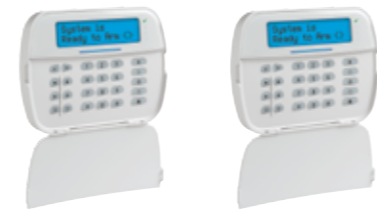
HS2LCDRF8 Full Message LCD Keypad with Built-in PowerG Transceiver HS2LCDRFP8 Full Message LCD Keypad with Built-in PowerG Transceiver & Prox Support