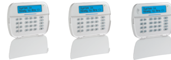
HS2LCDWF8 Wireless Full Message LCD PowerG 2-Way Wire-Free Keypad HS2LCDWFP8 Wireless Full Message LCD PowerG 2-Way Wire-Free Keypad with Prox Support HS2LCDWFPV8 Wireless Full Message LCD PowerG 2-Way Wire-Free Keypad with Prox Support & Voice Prompting