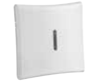
HSM2HOST8 PowerG Host Transceiver Module