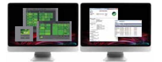
WebSA System Administrator Software Routine System Management Software