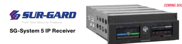
SG-System 5 IP Receiver