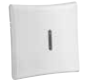
PG8920 Wireless PowerG Repeater